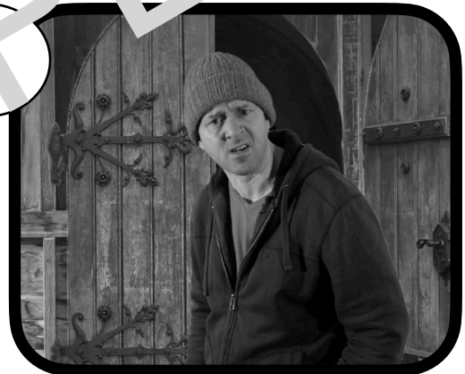
Judas leaves the supper to betray Jesus