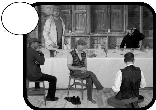
Jesus washes the disciples feet