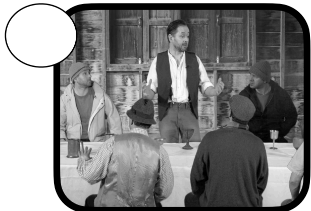
Jesus gathers his friends to celebrate the passover