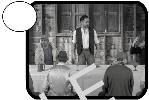
Jesus tells his disciples one of them will betray him