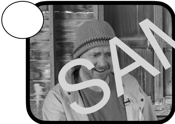
Peter tells Jesus he can't wash his feet