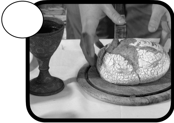
Jesus shares bread and wine

Can you put these pictures into order? Write numbers 1-6 in the circle next to the pictures in the order you think they happened.